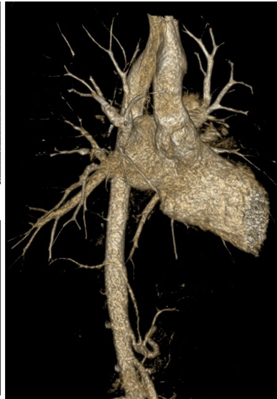
CTPA. 3D reconstruction