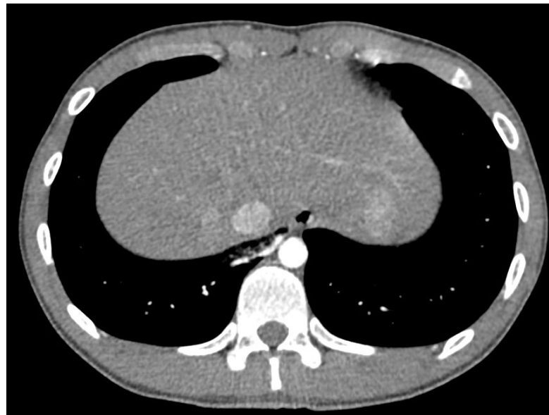
CTPA. Axial MPR with the use of MIP (soft tissue)